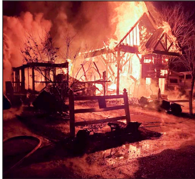
A fire, breaking out at Enchanted Valley RV Resort late Saturday night, destroying three homes.

At least 15 volunteers responded to the fire, providing major knocked-down assistance