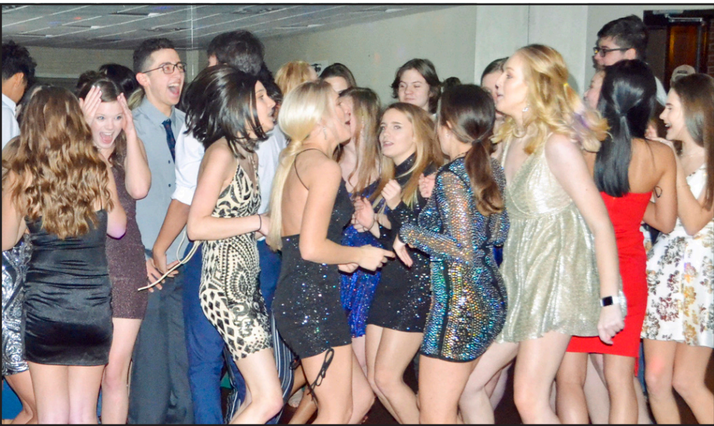
Towns County High students had a great time over the weekend cutting a rug at the Civic Center on Saturday.